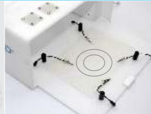
Cutting & Dissecting